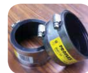
Steel Band Couplings